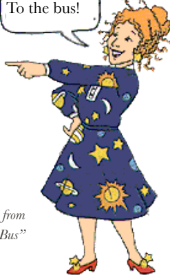
Ms. Frizzle from "The Magic School Bus"